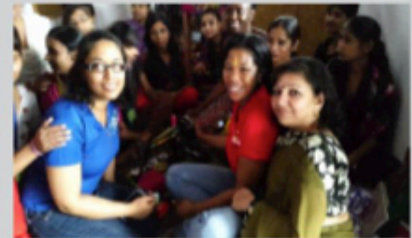
Skills Training for Women