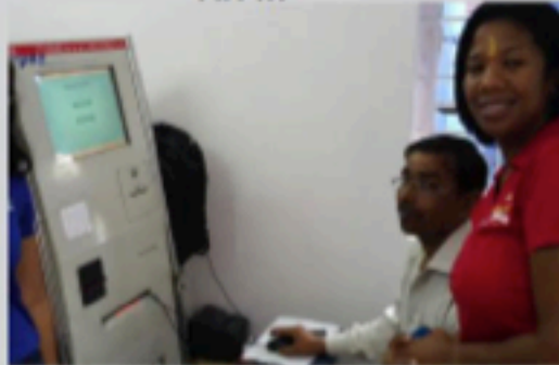
Anytime Payment Machine – ATPM